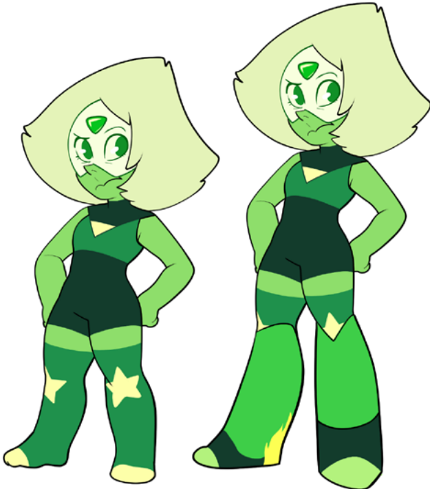
Reformed Peridot costume ideas, for fun.