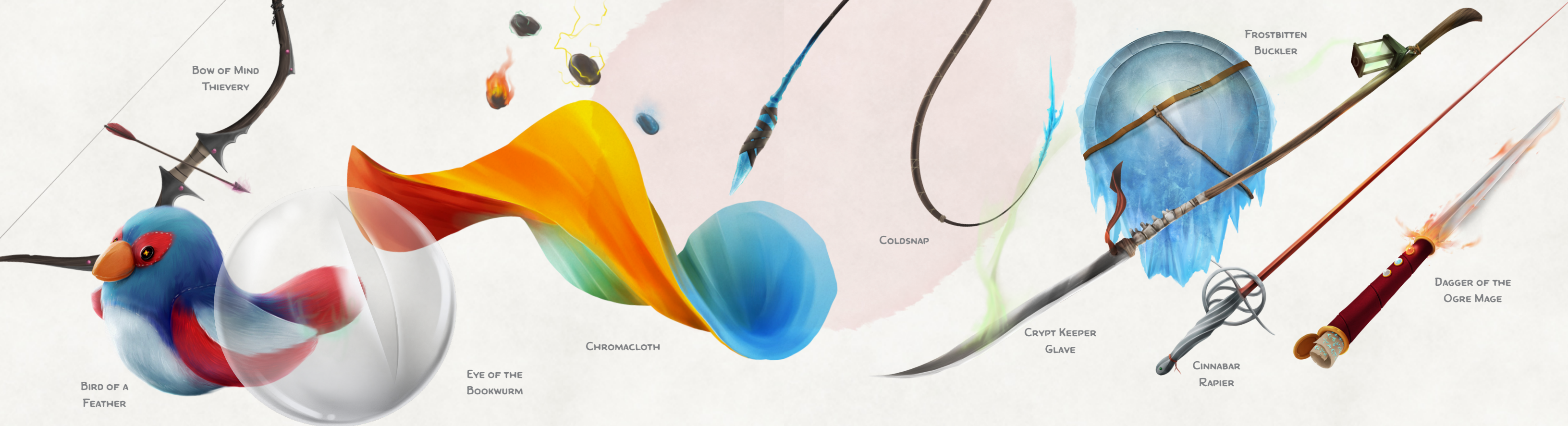
BIRD OF A FEATHER