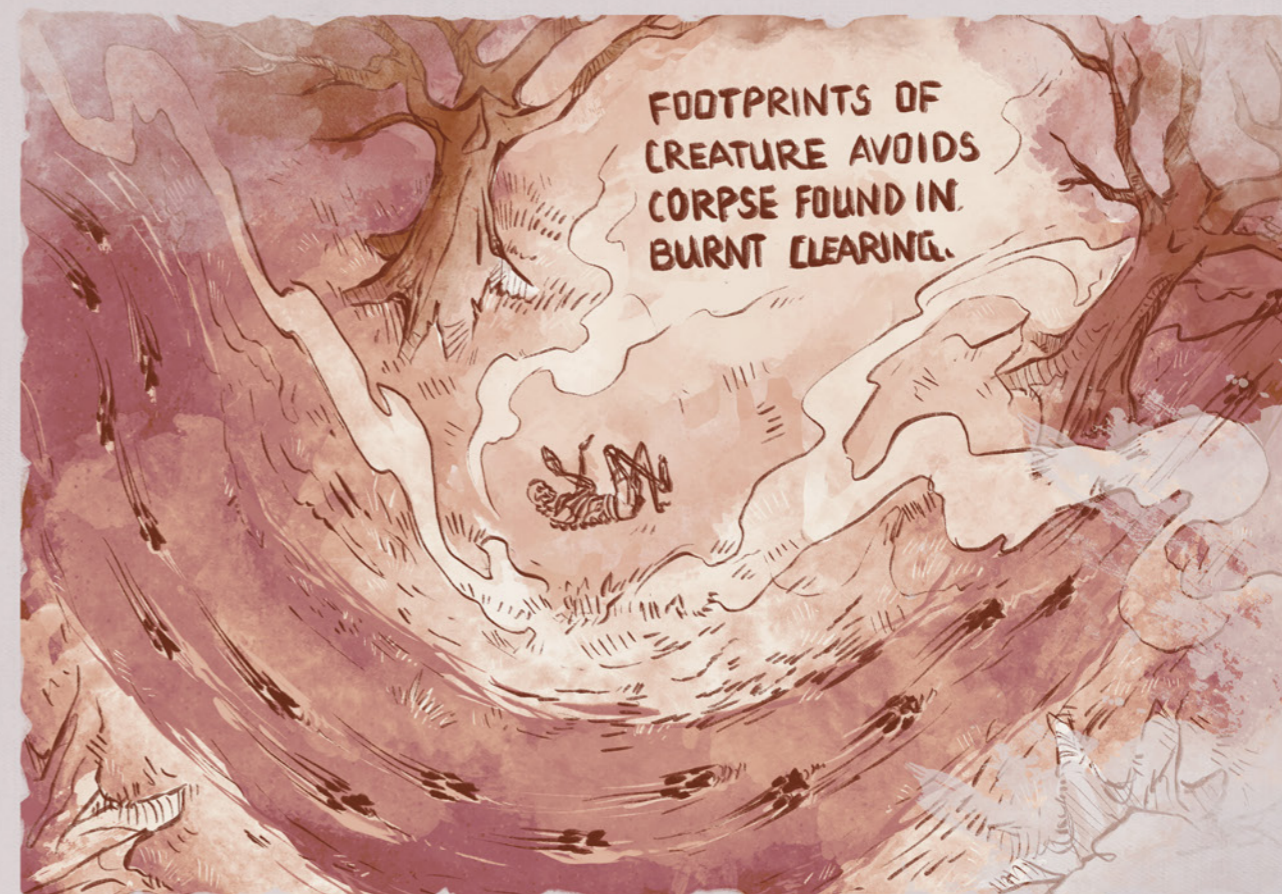
HANDOUT 3. FLAME SAFE

Fear of Flame. Casually searching the area uncovers unidentifiable claw marks and tracks ringing the burnt area's outer edge, and a successful DC 13 Wisdom (Perception) or Intelligence (Investigation) check finds the overturned lantern, revealing the source and the sequence of events. A casual search of Isla's body reveals no wounds besides minor burns and scorched clothing, and a successful DC 13 Wisdom (Medicine) check confirms she died of smoke inhalation.