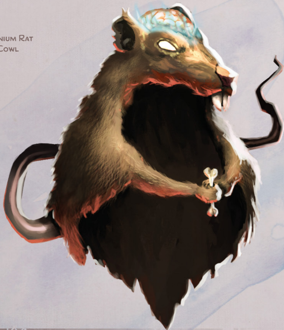
CRANIUM RAT COWL

Legendary variant: Increase the DC to 18 and the die of the Psionics property to a d10 . Add confusion , dominate person , and dominate monster to the spells that can be cast with the Psionics property. While wearing the cowl, you have advantage on saving throws against divination spells. The item has the Telepathic Shroud property.