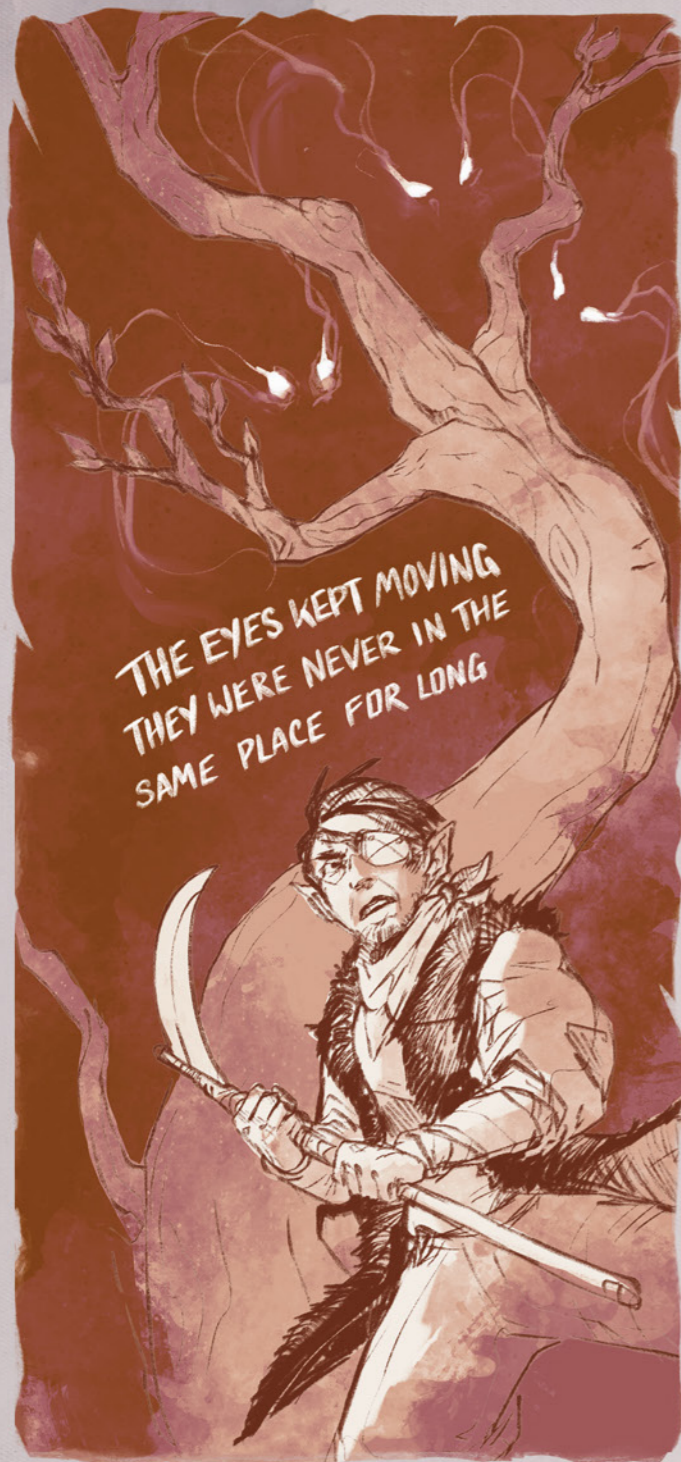
HANDOUT 2. SHADOW DANCE