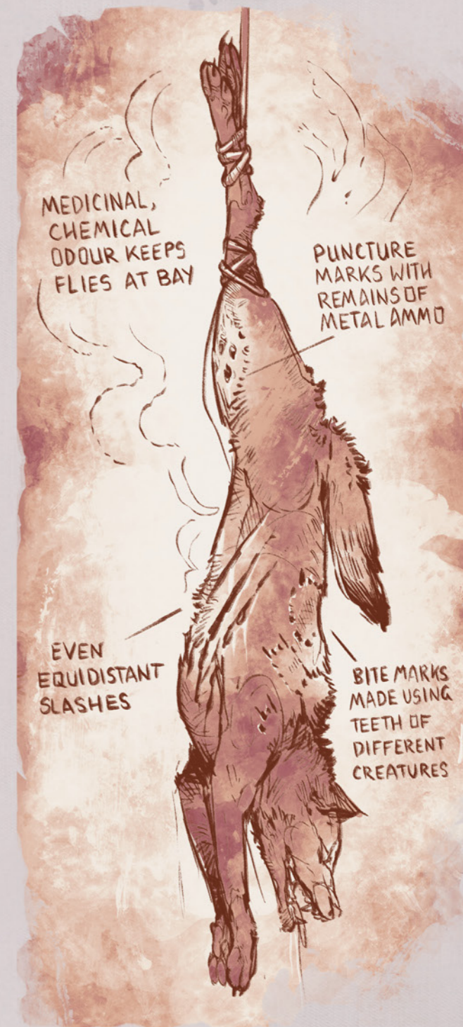
HANDOUT 1. RAVAGED CORPSE

The Beast. A successful VDC Wisdom (Survival) check determines the teeth marks—while definitely made by animal fangs—don't match the imprint of any animal local to the area. If the check succeeds by 5 or more, the character recognizes multiple fang types, as if the bites were made by a single mouth constructed using various animal teeth. These teeth marks combined with the pungent medicinal smell indicates that this is surely some sort of Construct and not of the natural world.