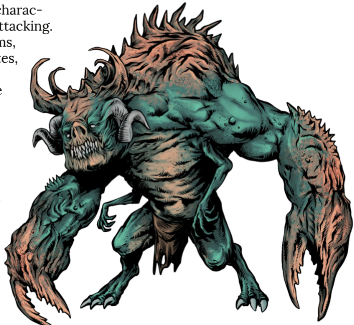
Fat Goblin Games