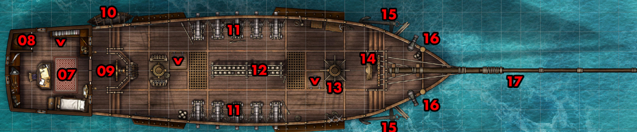
Schooner - Main Deck