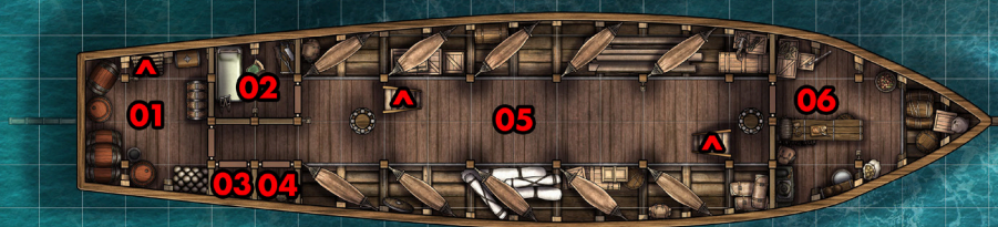
Schooner - Lower Deck