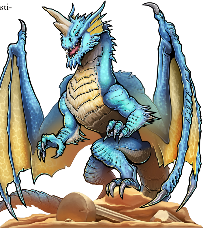
Blue Dragon Plateau

If the characters have to leave and return, Zolar is quick to bring in reinforcements. Increase the level of the adventure by one increment (from 8th to 11th, for example) to account for this. If you are running the 14thlevel version of the adventure, Zolar instead decides to completely abandon the lair, recognizing that the threat of the characters is too great for him and his current crop of minions. This annoyance won't be forgotten, however, and Zolar will do his best to haunt the characters for the rest of their days. \Omega