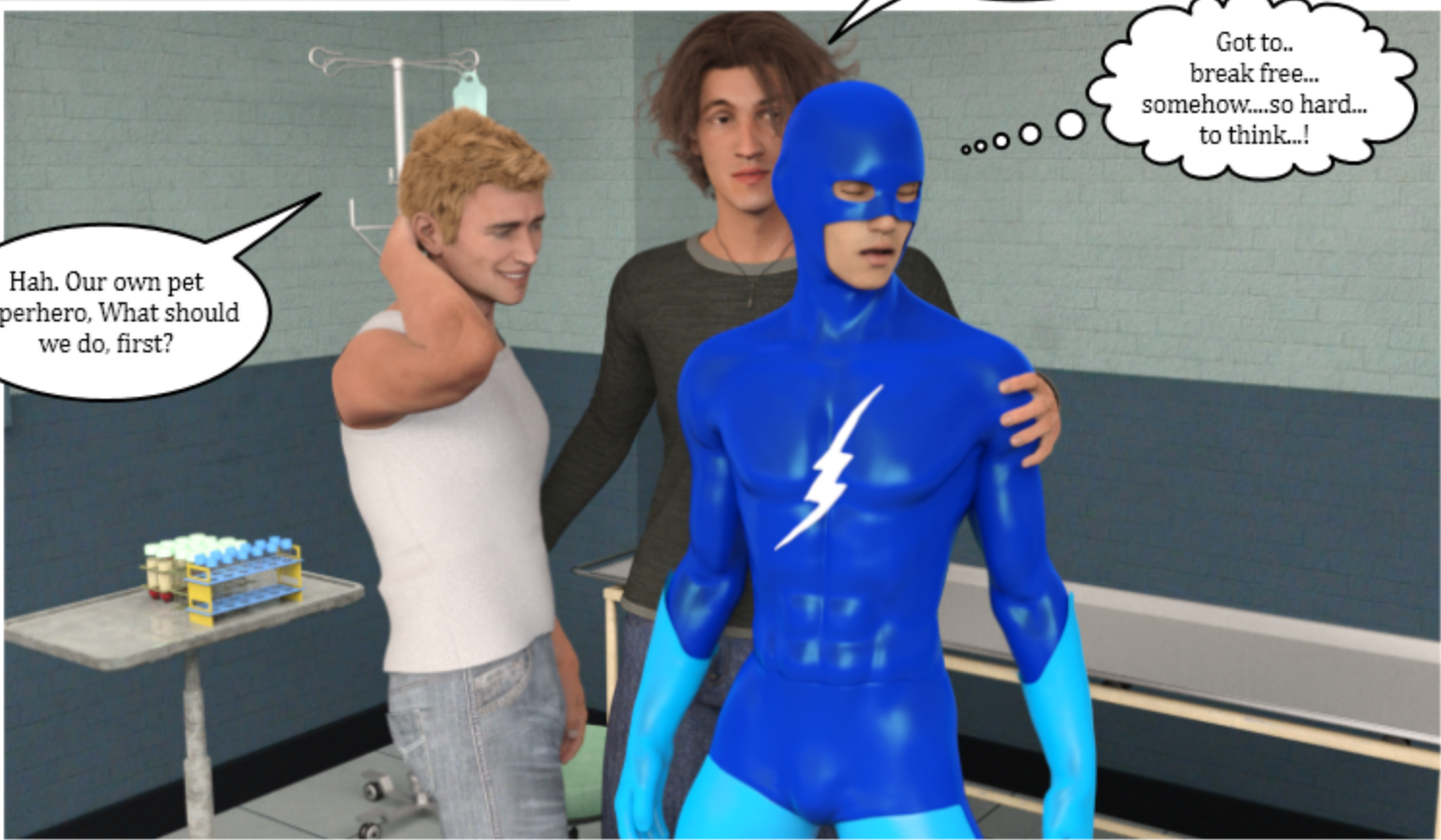
Hah. Our own pet superhero, What should we do, first?