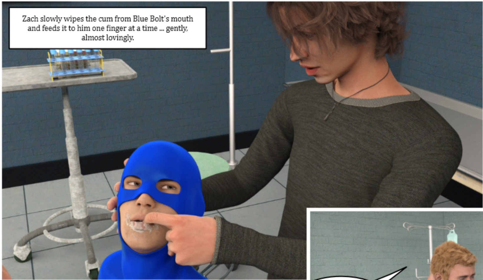
Zach slowly wipes the cum from Blue Bolt's mouth and feeds it to him one finger at a time ... gently, almost lovingly.