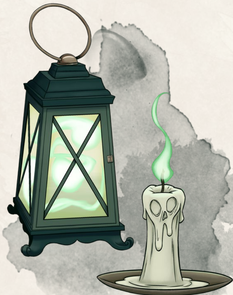
Wisp Lantern & Fool's Candle Artwork by DM Tuz

The illusion is not solid and a creature can use an action to examine the image and determine that it is an illusion without having to touch it with a successful DC 14 Intelligence (Investigation) check. Once determined, the creature can see through the image and see the burning candle that created it.