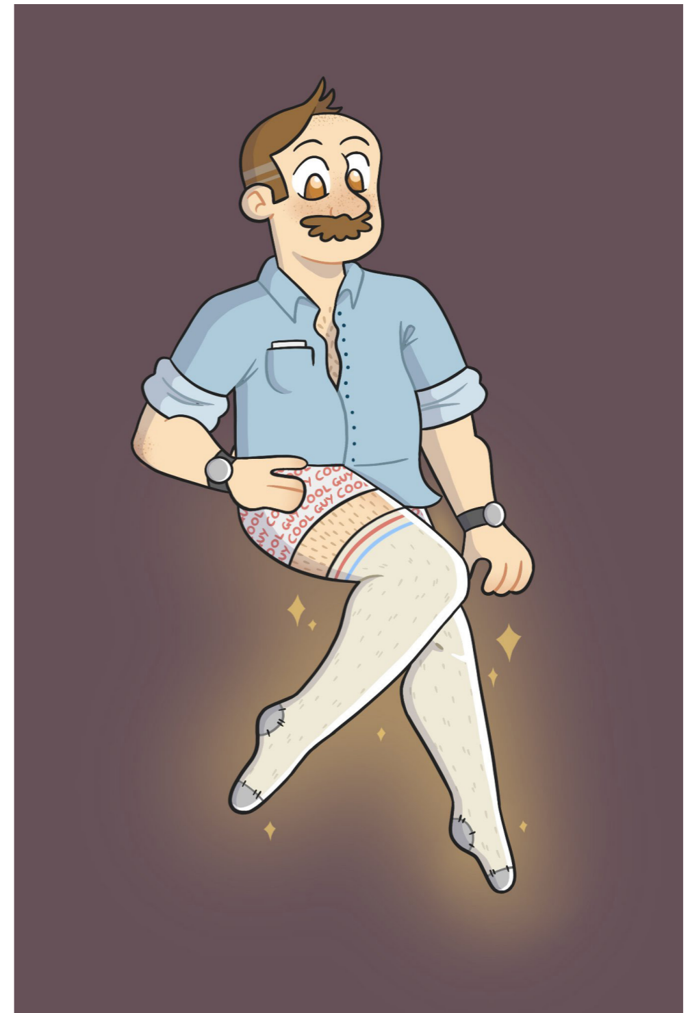
Artist: @carryondrawing ( Twitter )