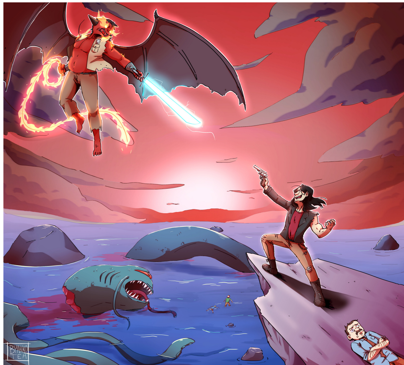
Artist: Alyssa 'Tora' Aman ( Twitter )