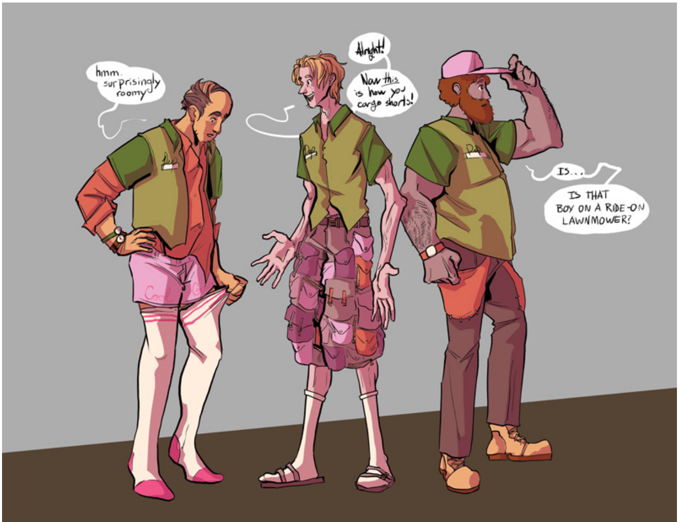
Artist: Catherine Dubois ( Twitter )