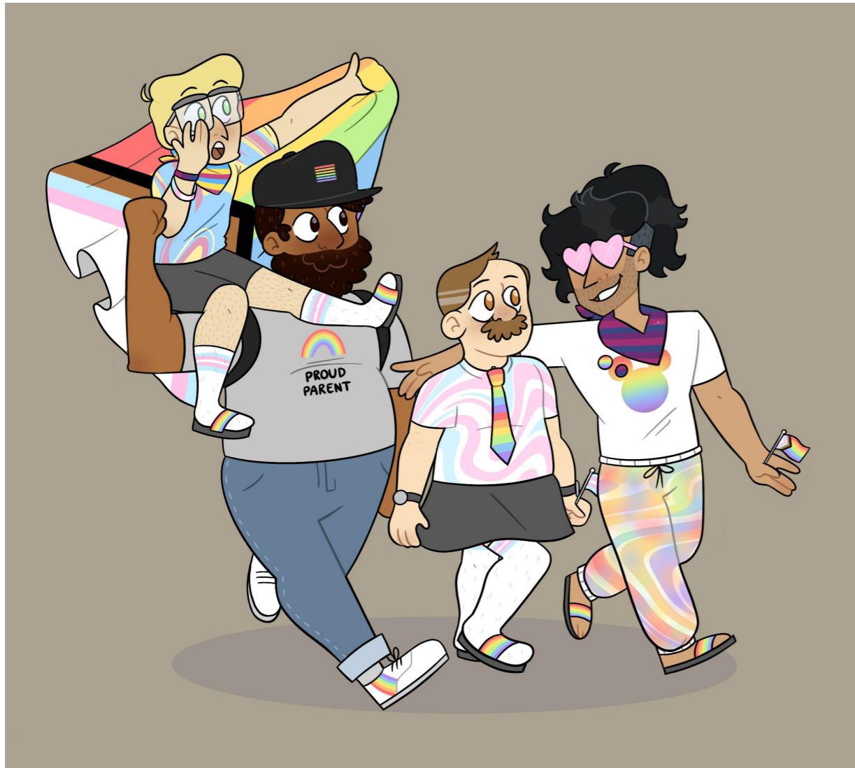
Artist: @carryondrawing ( Twitter )